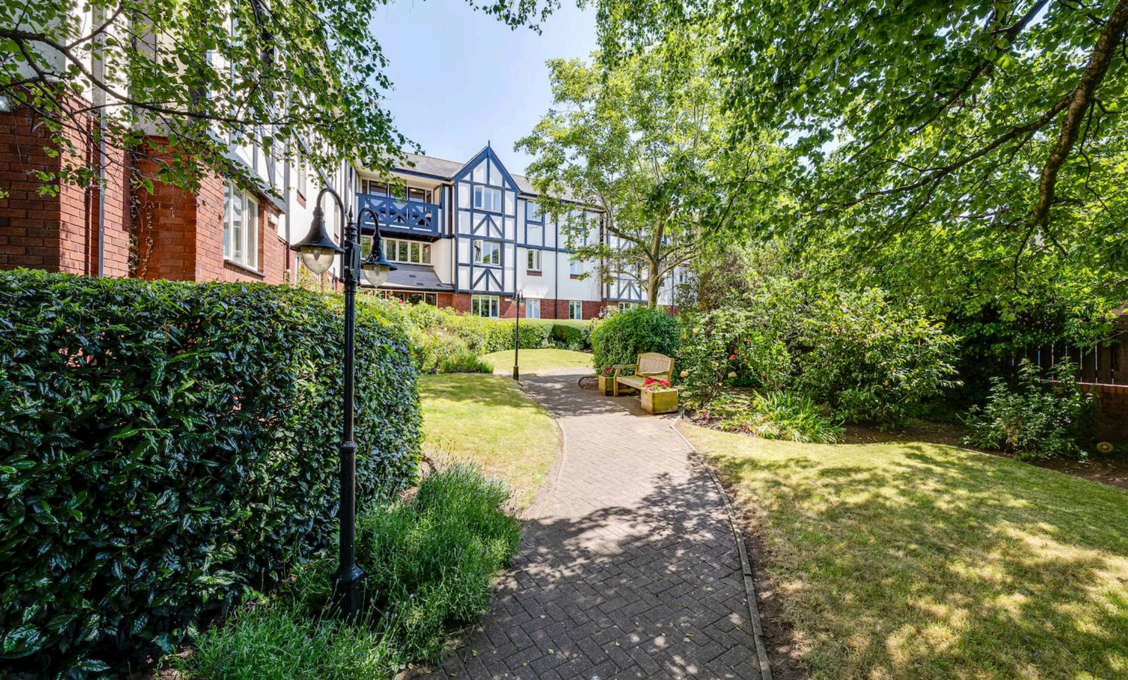
4 Queens Park House Queens Park View, Chester £150,000