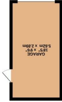
GROUND FLOOR 886 sq.ft. (82.3 sq.m.) approx.

TOTAL FLOOR AREA : 1591 sq.ft. (147.8 sq.m.) approx.