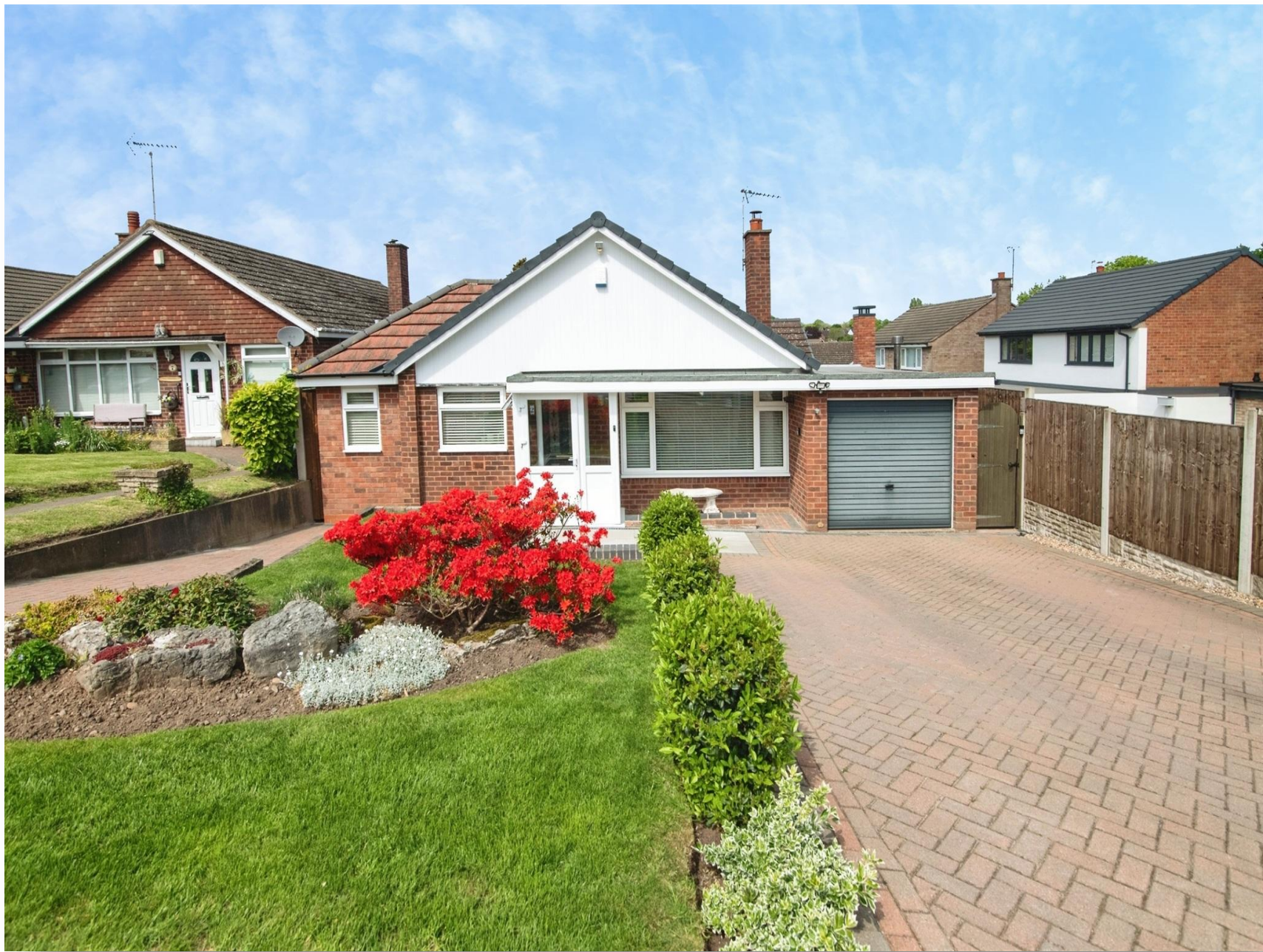
Elm Drive, Birmingham B43 6AT