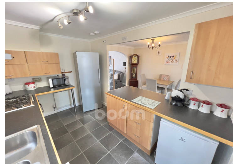
McMillan Crescent, Beith