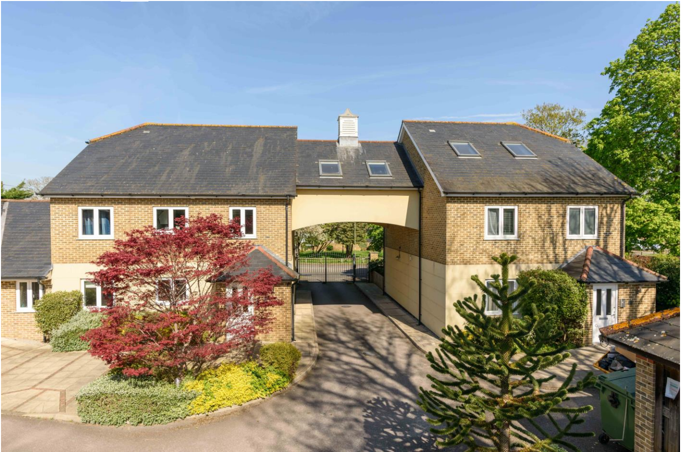
12 Halliford Court The Green Shepperton TW17 8QZ