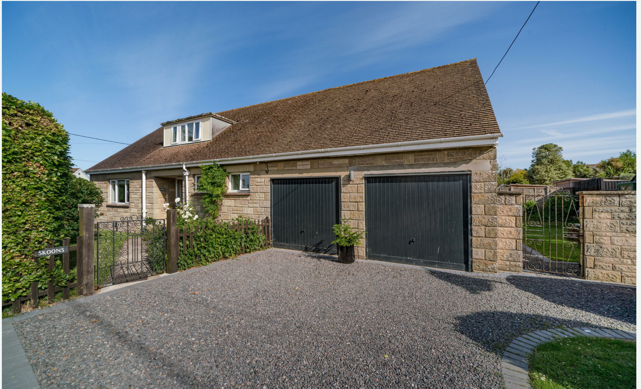
Skoons, Lane End Road, Bembridge, Isle of Wight, PO35 5UE