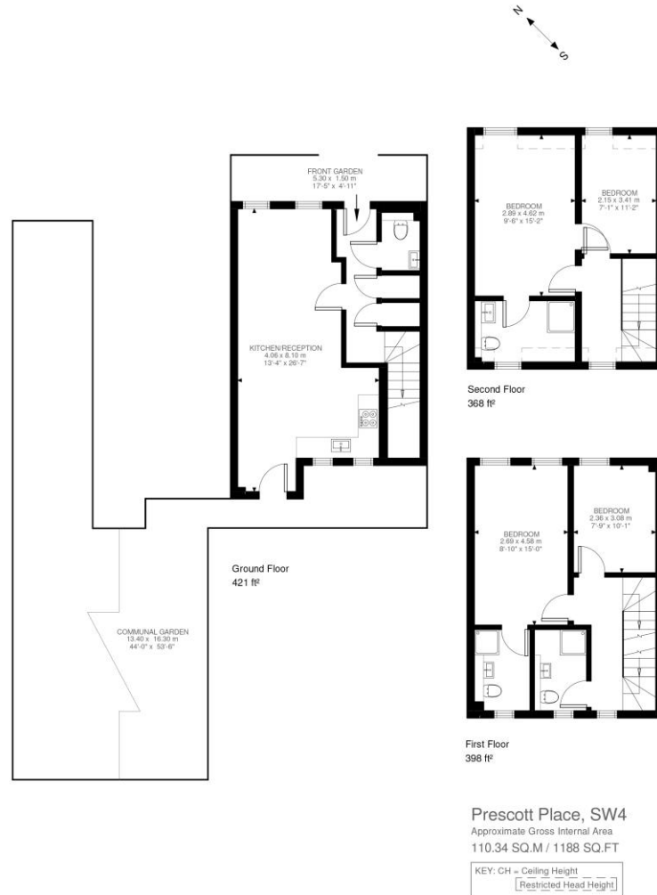
Illustration for identification purposes only. Not to scale. Floor Plan Drawn According To RICS Guidelines.

Chesterton UK Services Limited trading as Chestertons for themselves and for the vendor of this property whose agents they are, give notice that (i) these particulars do not constitute any part of an offer or contract, (ii) all statements contained within these particulars are made without responsibility on the part of Chestertons or the vendor, (iii) whilst made in good faith, none of the statements contained within these particulars are to be relied upon as a statement or representation of fact, (iv) any intending purchasers must satisfy themselves by inspection or otherwise as to the correctness of each of the statements contained within these particulars, (v) the vendor does not make or give either Chestertons or any person in their employment any authority to make or give representation or warranty whatsoever in relation to this property. Wide angle lenses may be used. ©Copyright Chestertons | Chesterton UK Services Limited | Registered Office 5th Floor, The Lantern, 75 Hampstead Road, London, NW1 2PL Registered Company Number 05334580.