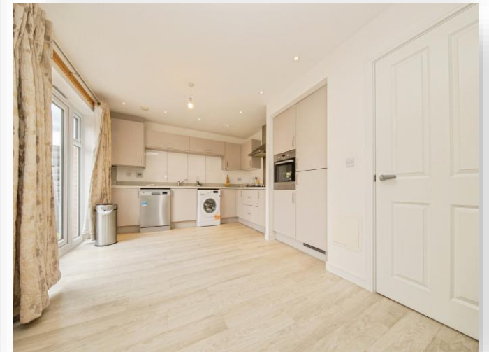
Portland Way, Great Blakenham, Ipswich, IP6 0FH