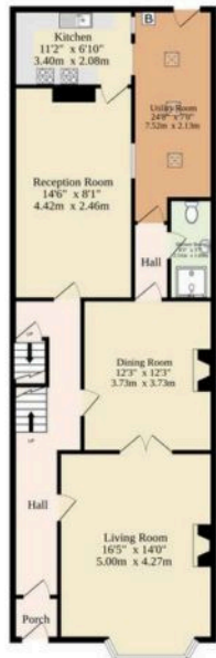
Ground Floor 562 sq.ft. (51.9 sq.m.) approx.