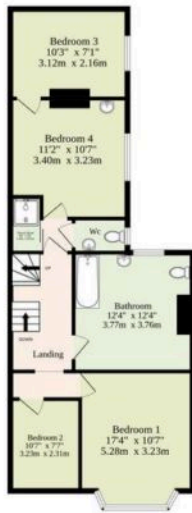
1st Floor 711 sq.ft. (65.7 sq.m.) approx.