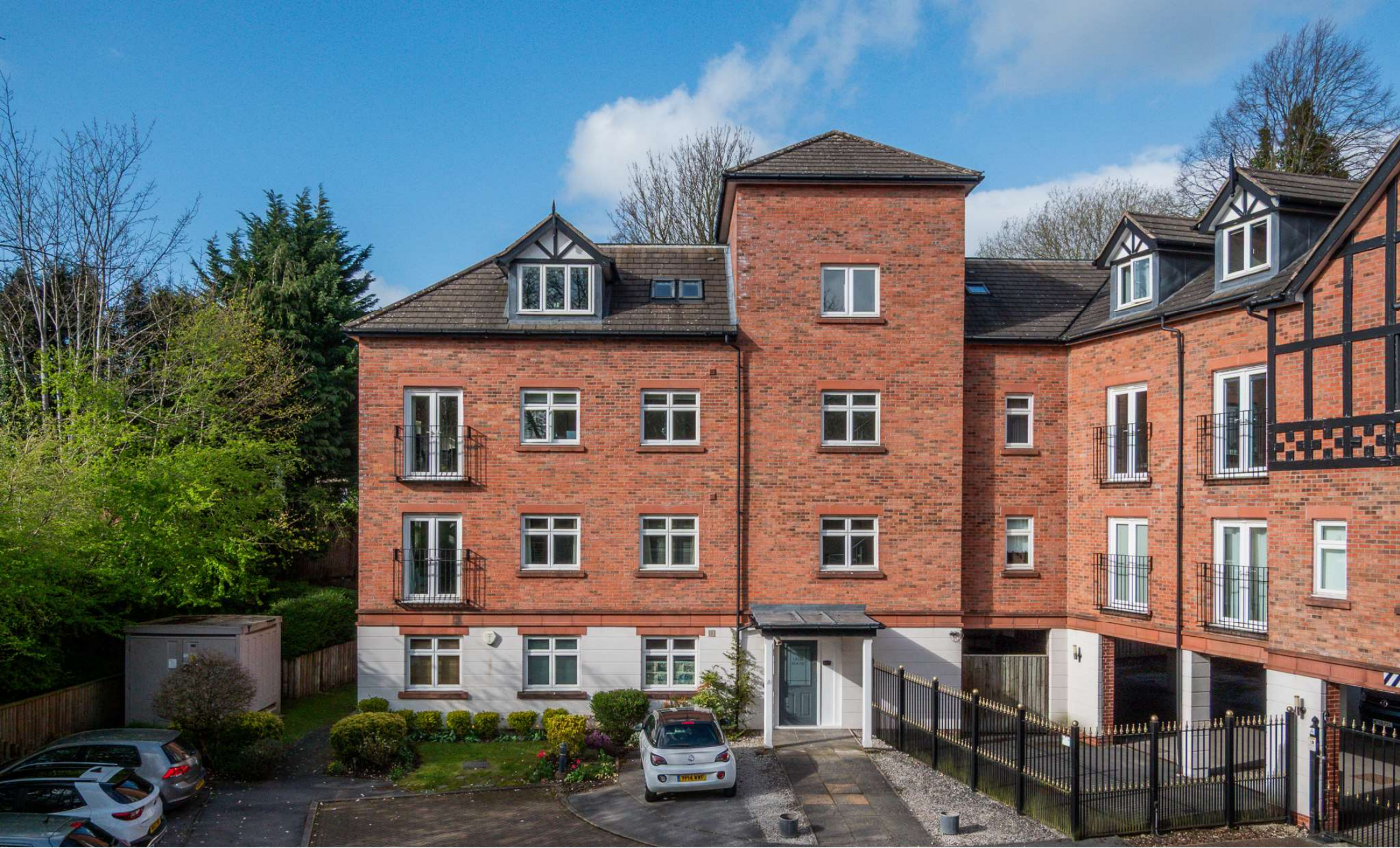
Knutsford Legh House, Hollow Lane