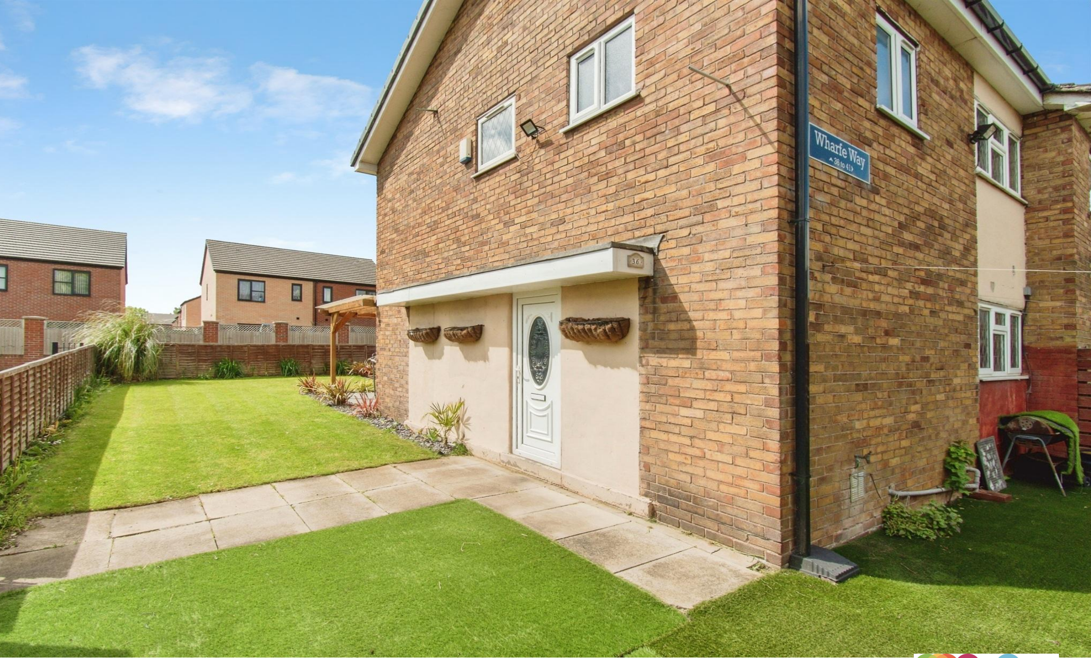
Wharfe Way, Castleford WF10 3DT