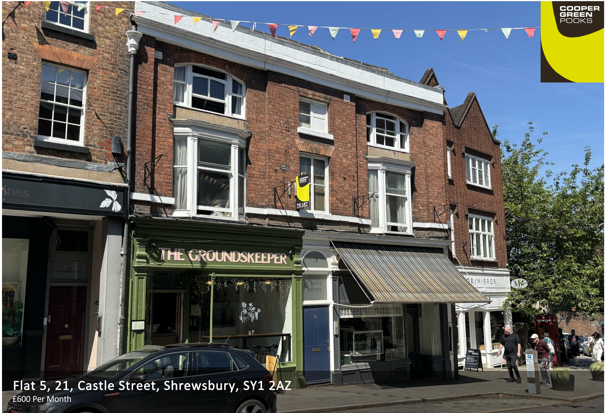
Flat 5, 21, Castle Street, Shrewsbury, SY1 2AZ £600 Per Month