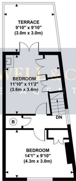
FRIST FLOOR GROSS INTERNAL FLOOR AREA 315 SQ FT