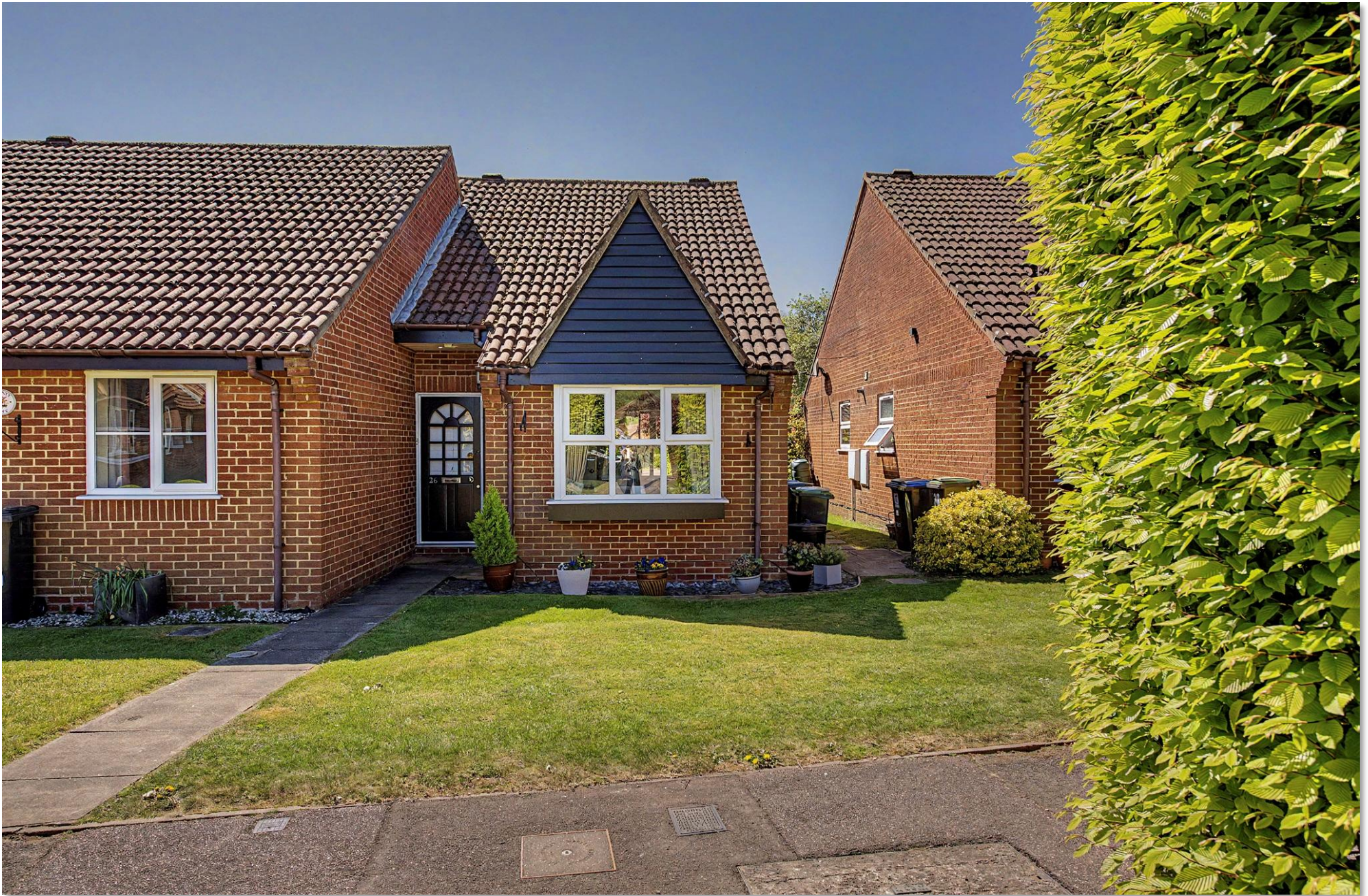
Emerton Garth, Northchurch Berkhamsted HP4 3XJ