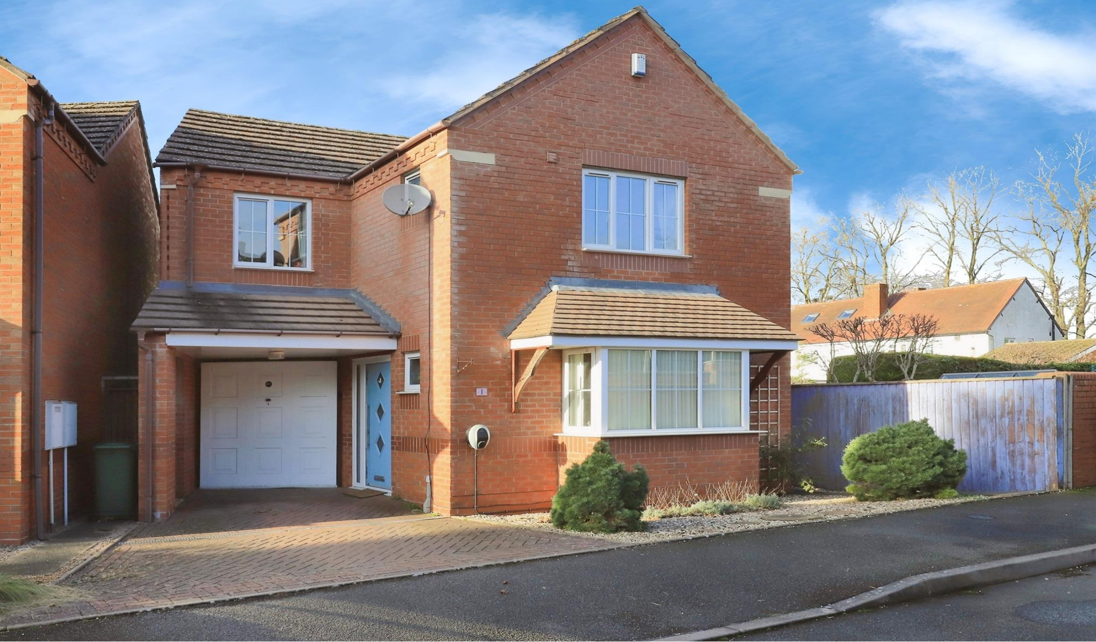
Overman Close, Stourbridge, DY9 7ED