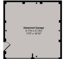
Detached Garage Approx 27 sq m / 286 sq ft

This floorplan is only for illustrative purposes and is not to scale. Measurements of rooms, doors, windows, and any items are approximate and no responsibility is taken for any error, omission or mis-statement. Items such as bathroom suites are representations only and may not look like the real items. Made with Magic Snappy 360.