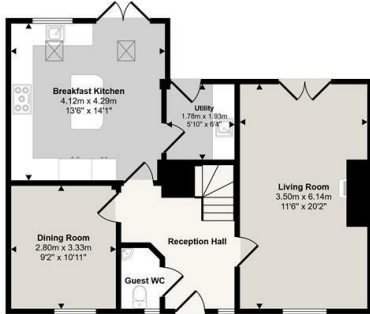
Ground Floor Approx 67 sq m / 719 sq ft

Approx Gross Internal Area 212 sq m / 2277 sq ft