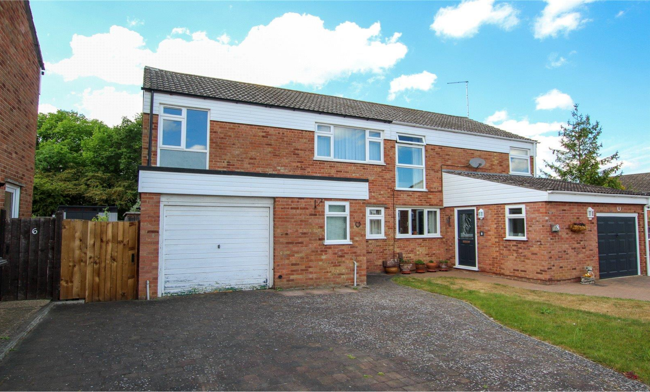
Pheasant Rise, Bar Hill Cambridge CB23 8SA