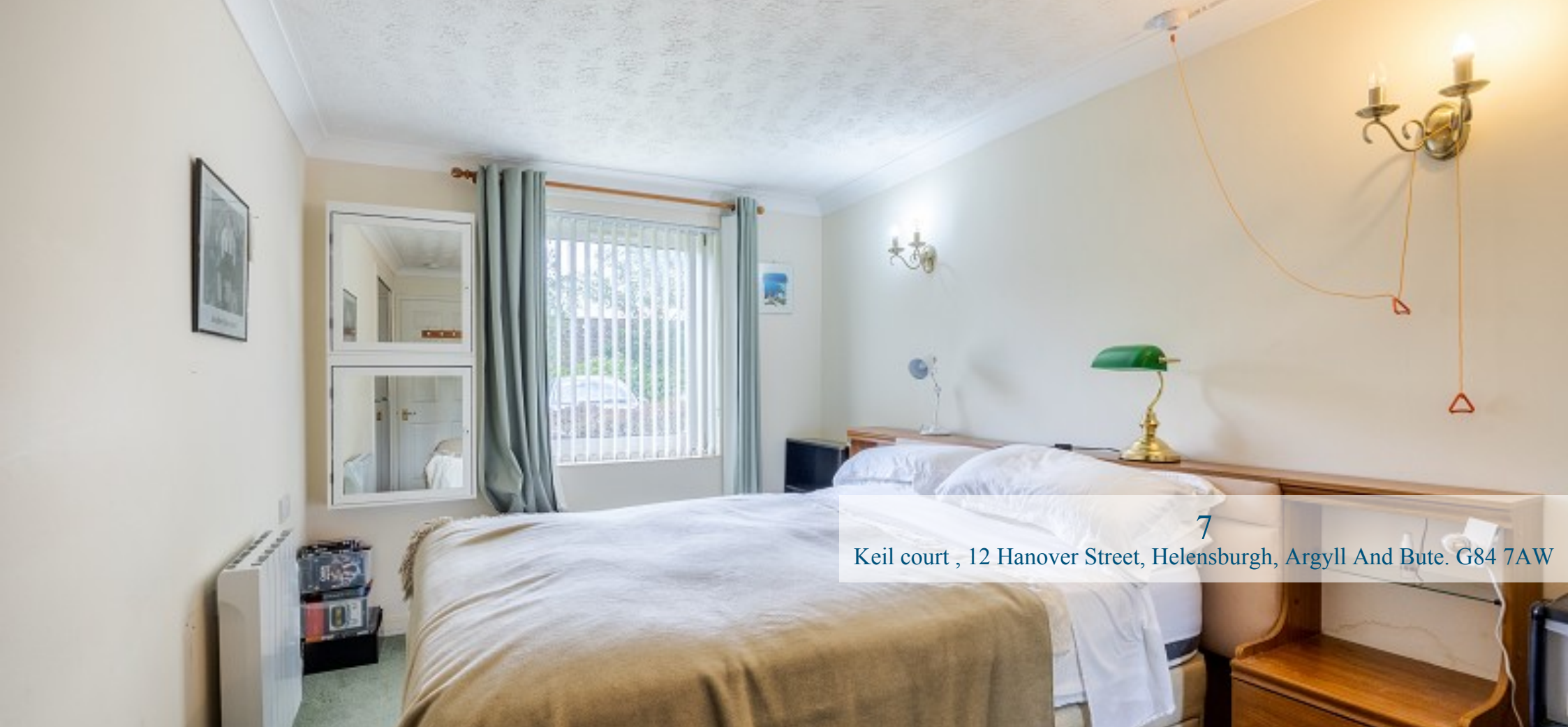
7 Keil court , 12 Hanover Street, Helensburgh, Argyll And Bute. G84 7AW