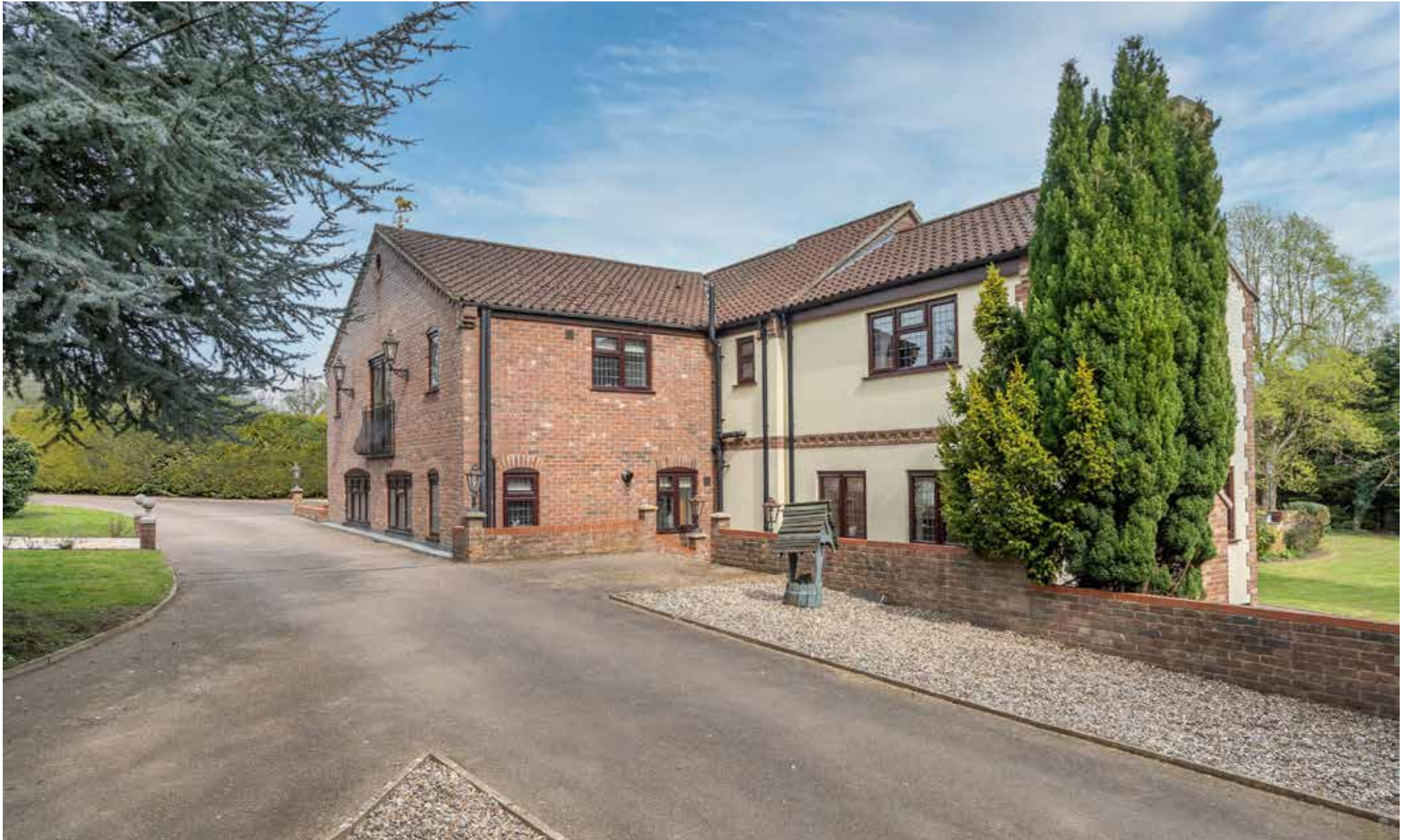
The Cottage Shack Lane | Blofield | Norfolk | NR13 4DP