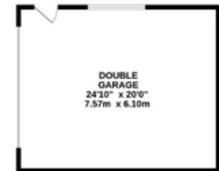
GARAGE 502 sq.ft. (46.7 sq.m.) approx.

FLOOR AREA - HOUSE (EXCLUDING POOL ROOM & GARAGE) : 3592 sq.ft. (333.6 sq.m.) approx. TOTAL FLOOR AREA : 5319 sq.ft. (494.1 sq.m.) approx.