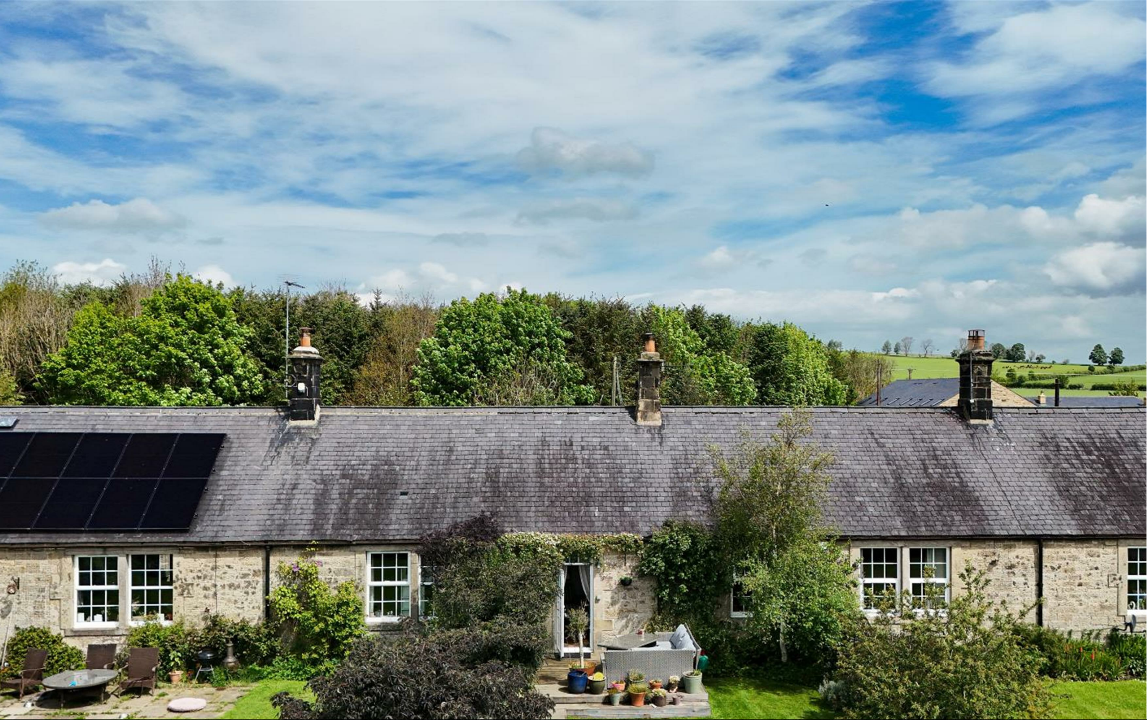
📍 Burnfoot Cottages, Morpeth NE65 7EY