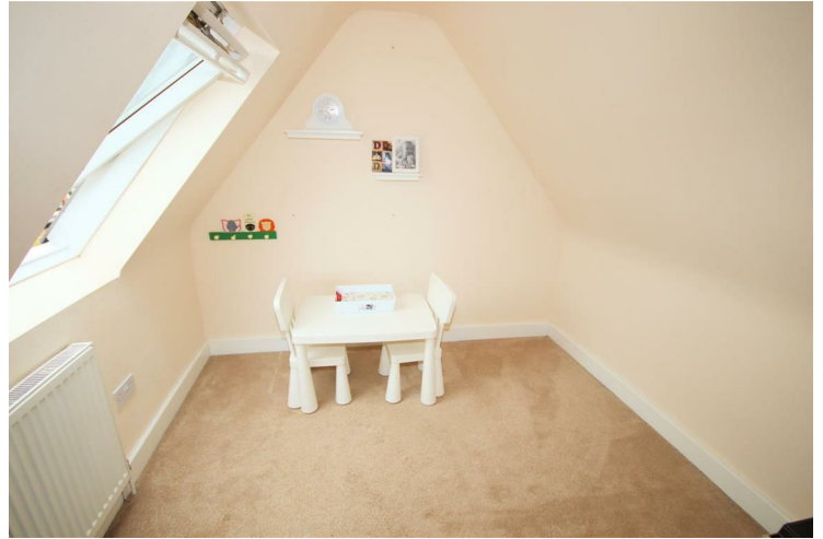
Bedroom 5 / Study 8'6" x 7'7" (2.59m x 2.30m)