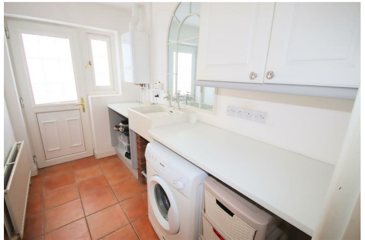
Utility Room 5'7" x 9'0" (1.71m x 2.74m)