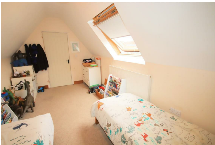
View of Bedroom 4