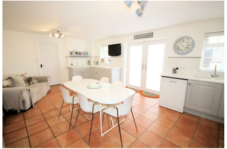
View of Kitchen/Breakfast Room