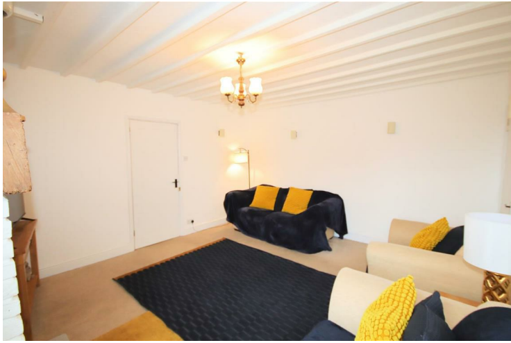
View of Dining Room / Family Room