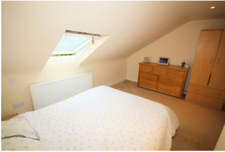
View of Bedroom 2