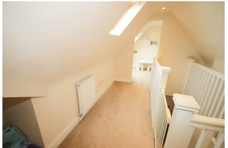
2nd Floor Landing

Double radiator, fitted carpet, double power point(s), access to bedroom 2 & 5.