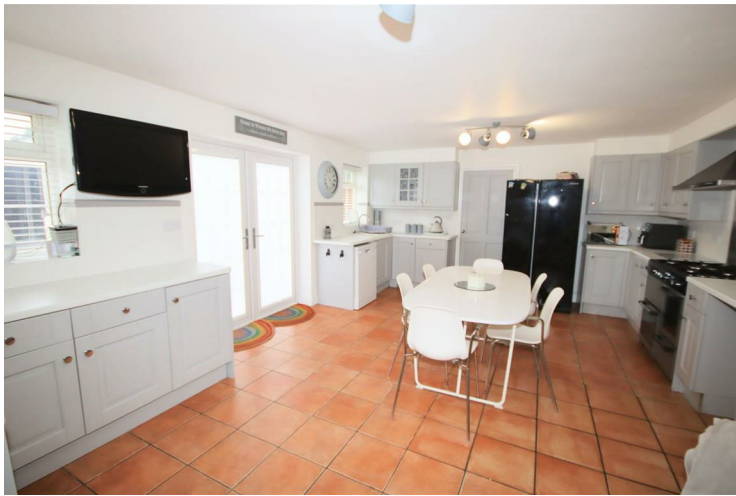
Kitchen/Breakfast Room 20'6" x 14'10" (6.25m x 4.52m)