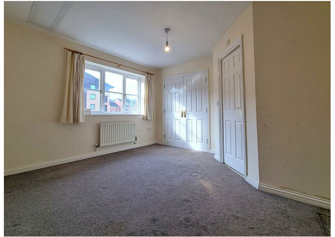
Bedroom One 11'5 x 10'8 (3.48m x 3.25m)