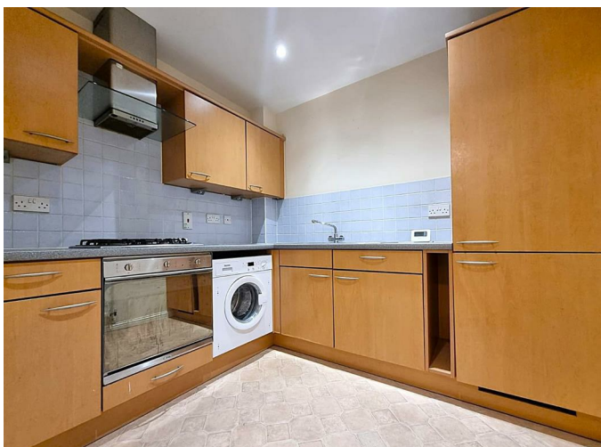
Fitted Kitchen 11'0 x 6'0 (3.35m x 1.83m)