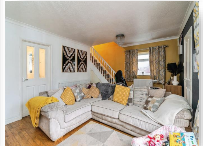
Candle Meadow, Colwick Park Nottingham NG2 4DX