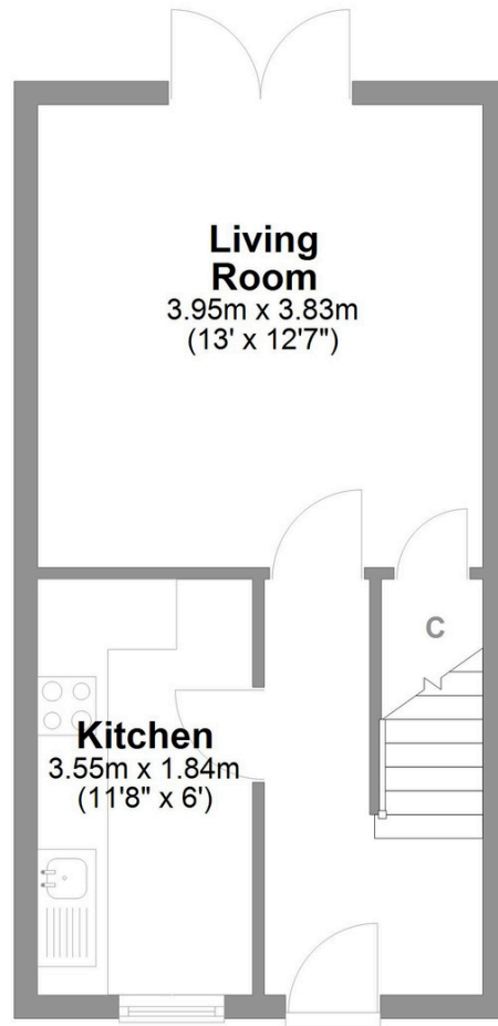
Ground Floor Approx. 29.0 sq. metres (312.5 sq. feet)

Total area: approx. 58.1 sq. metres (625.6 sq. feet)