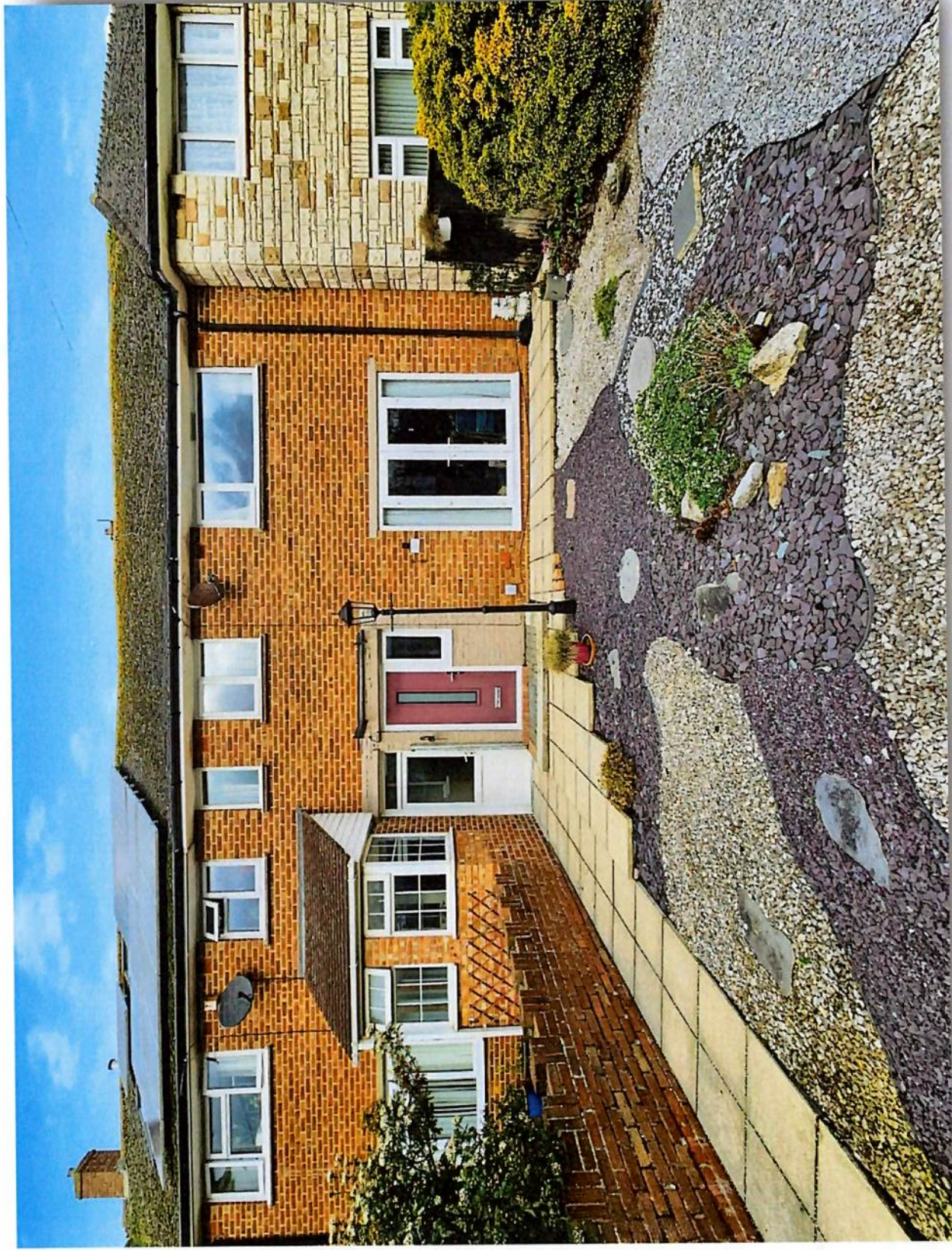
Chickerell Road, Weymouth DT4 0RD