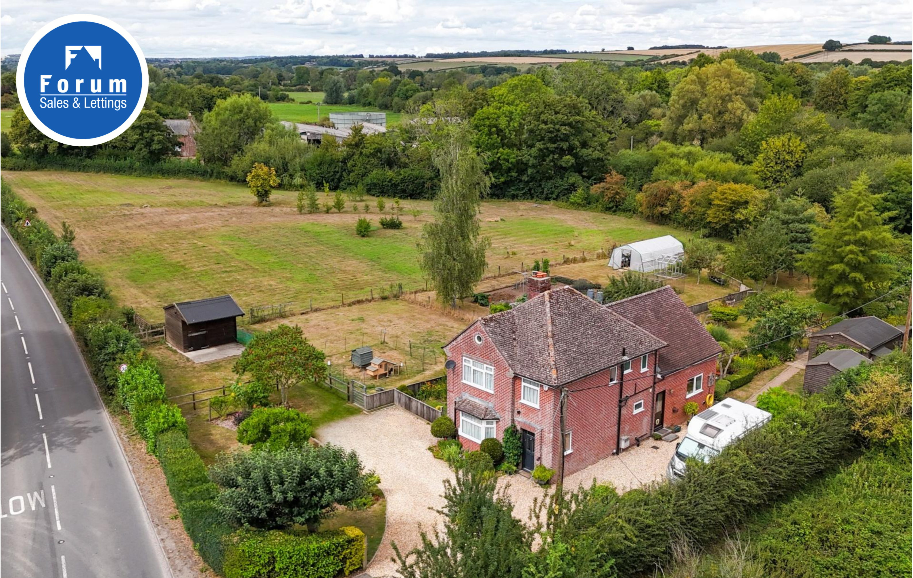
Chesterfield, Spetisbury, Dorset, DT11 9DF