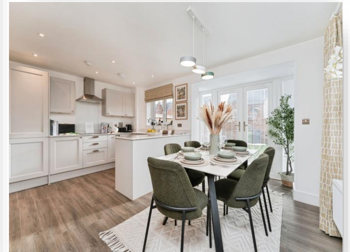
Plot 32 The Osiers, Edwards Way, Manea PE15 0HY