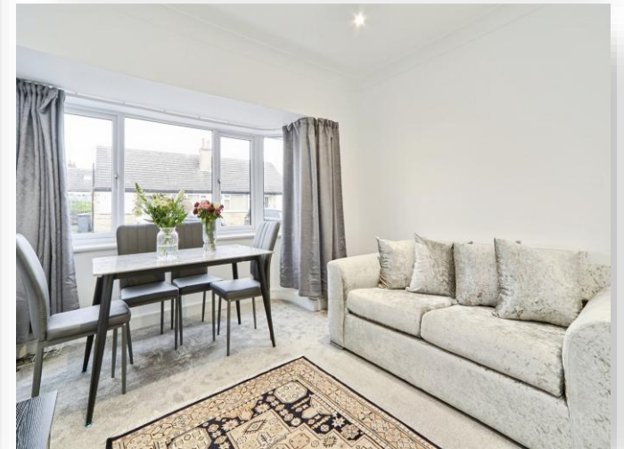
The Cedars, Bramhope Leeds LS16 9EA