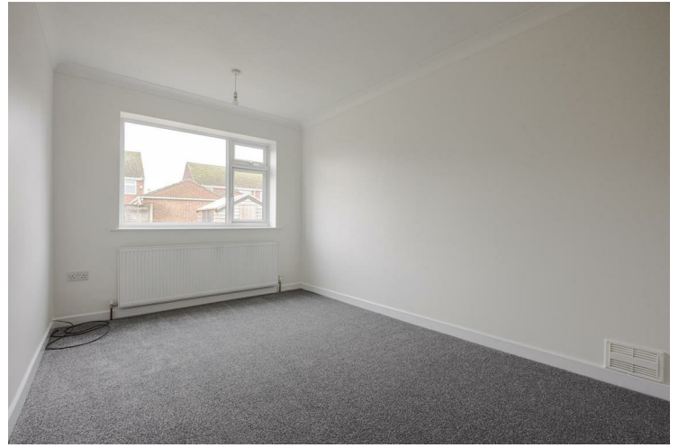
Bedroom two 13'6" x 8'10" (4.13 x 2.71)