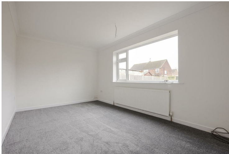
Bedroom one 15'7" x 9'4" (4.76 x 2.87)