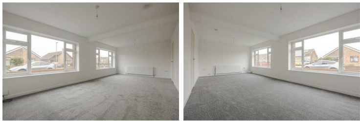
Lounge 24'6" x 11'9" (7.47 x 3.60)