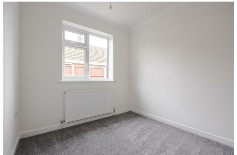
Bedroom three 8'10" x 7'10" (2.71 x 2.41)