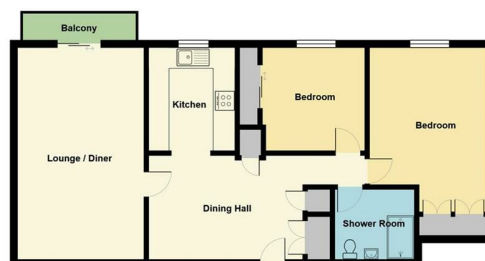
Flat 14, Clifton Court, 297, Clifton Drive South, Lytham St Annes, FY8 1HN

Total Area: 89.7 m 2 ... 965 ft 2 (excluding balcony)