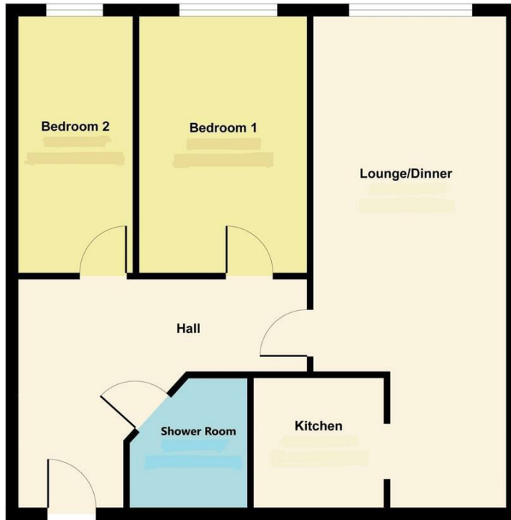
First Floor Approximate Floor Area 678 sq. ft (62.98 sq. m)

Approx. Gross Internal Floor Area 678 sq. ft / 62.98 sq. m Not to Scale. For illustration purposes only. Produced by Elements Property