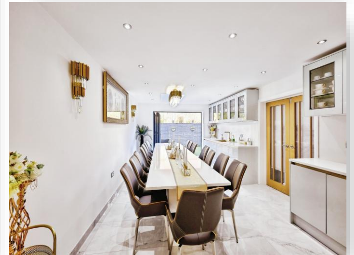
Home Farm Close, Little Billing, Northampton NN3 9AS