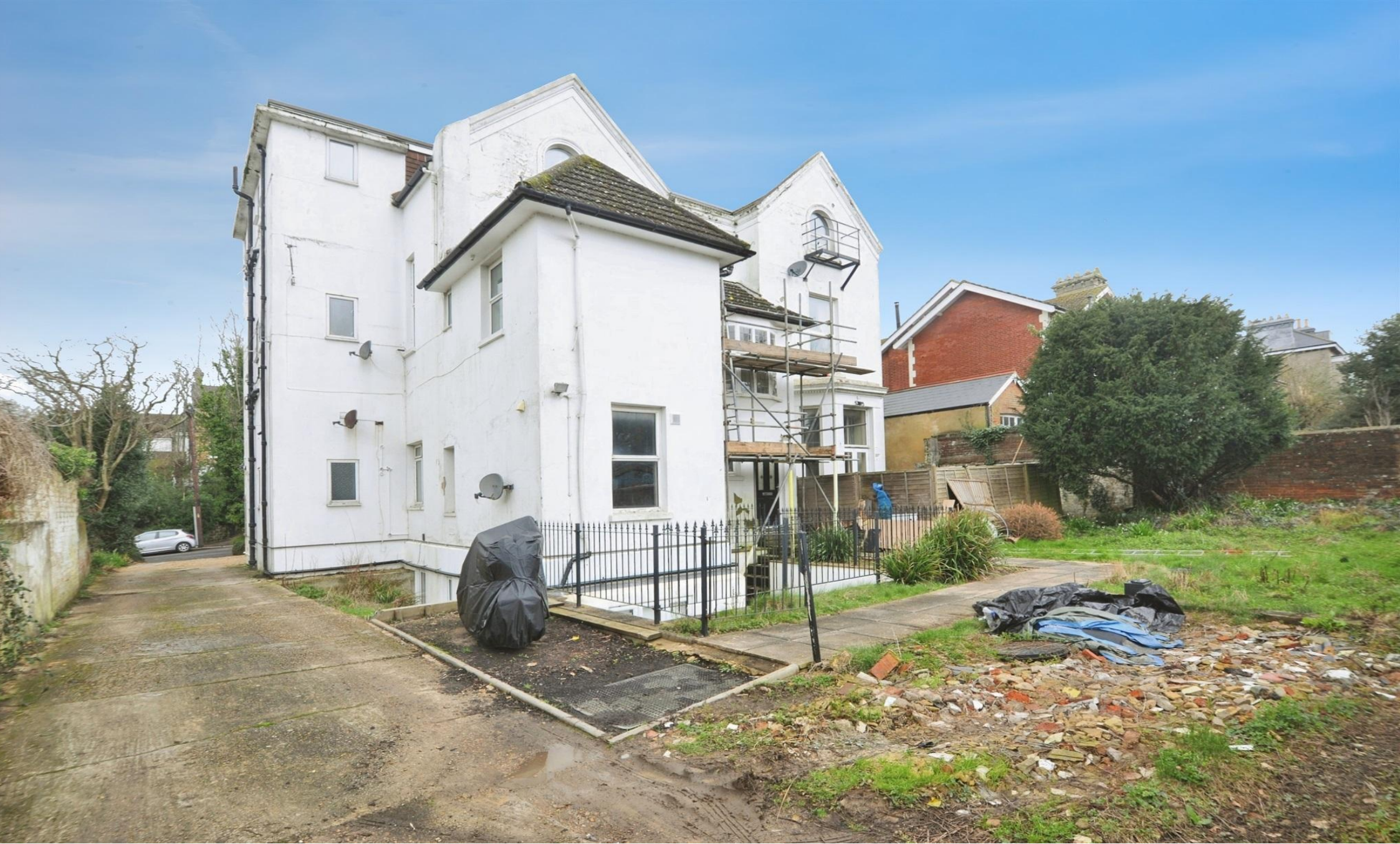
Upper Maze Hill, St. Leonards-On-Sea TN38 0LQ