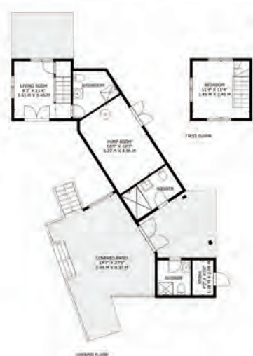
ANNEXE: 641 sq ft, 60 m 2 COVERED PATIO: 352 sq ft, 33 m 2

MAIN HOUSE GROSS INTERNAL AREA: 9317 sq ft, 865 m 2 LOW CEILINGS: 645 sq ft, 59 m 2 BELOW GROUND ADDITIONAL AREAS: 236 sq ft, 22 m 2