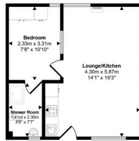
Annex Approx 34 sq m / 369 sq ft