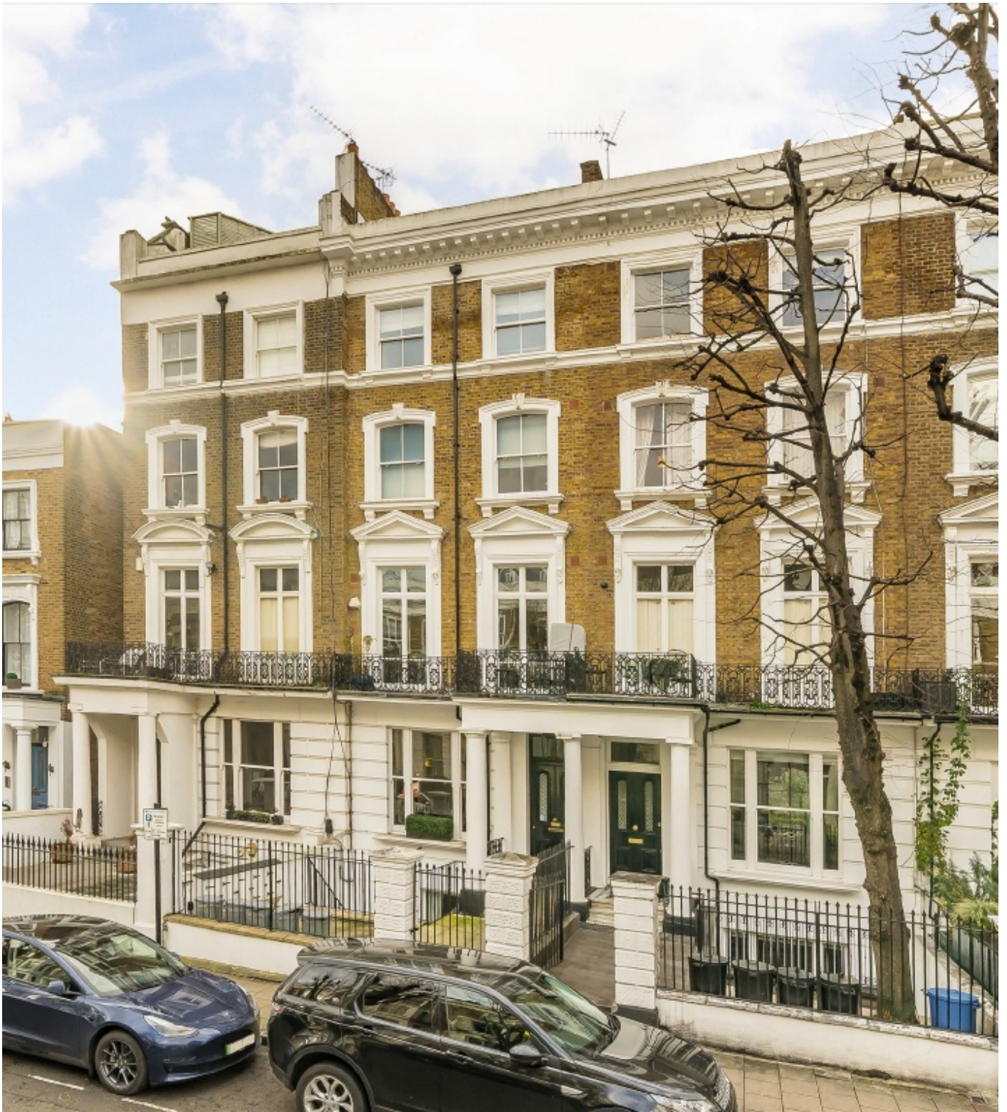
Leamington Road Villas, W11 £2,200,000