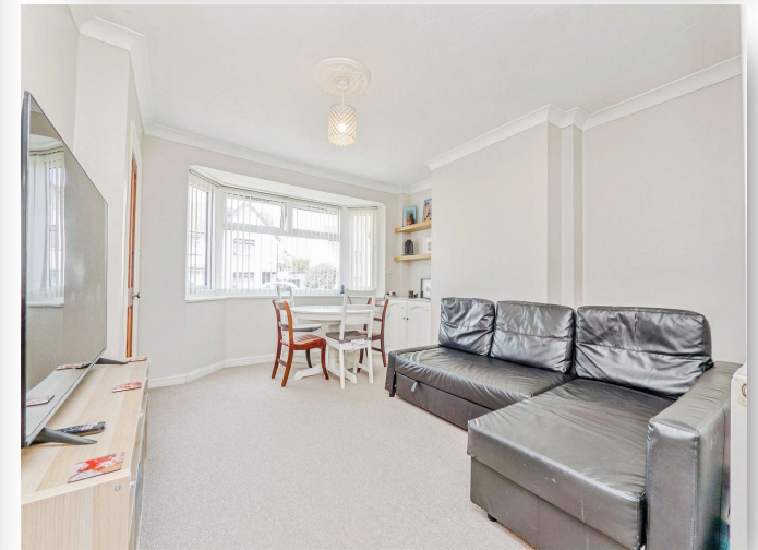
Mercia Road, Tremorfa Cardiff CF24 2TF