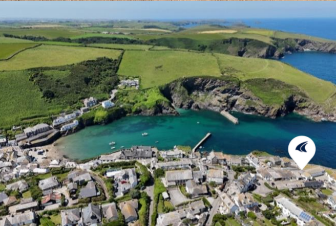
View from the sitting room