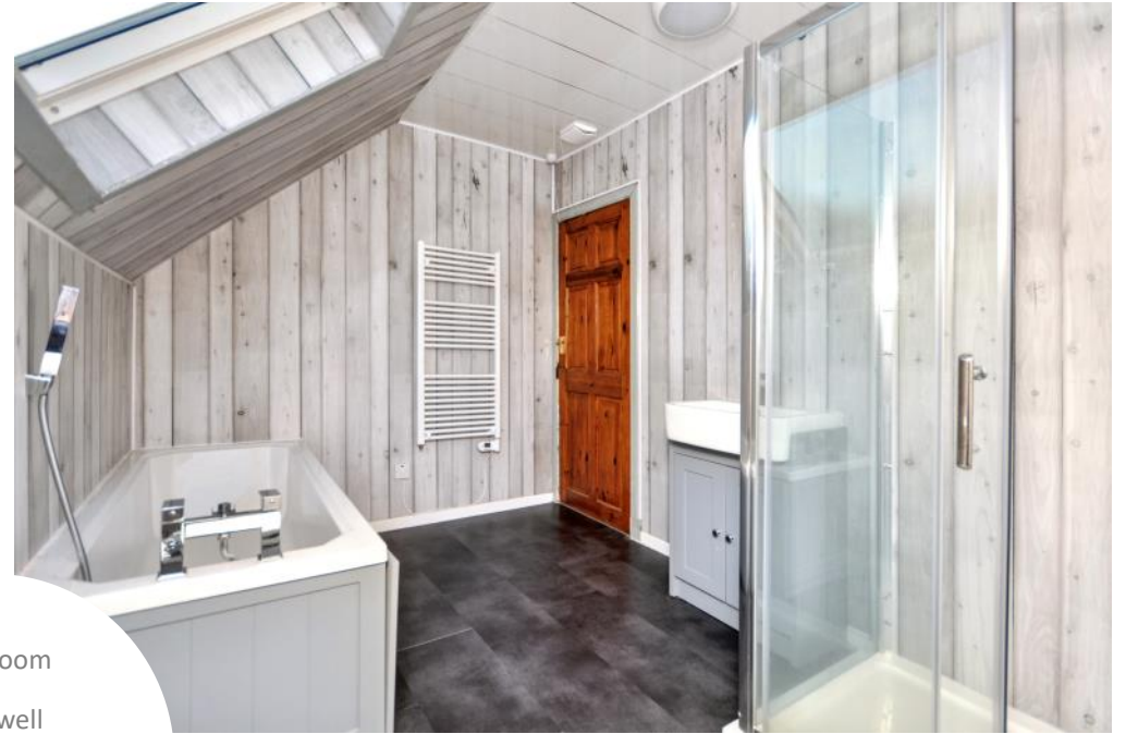
Bathroom Stairwell & Landing