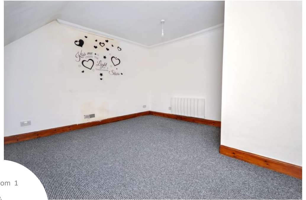
Bedroom 1 & Bedroom 2