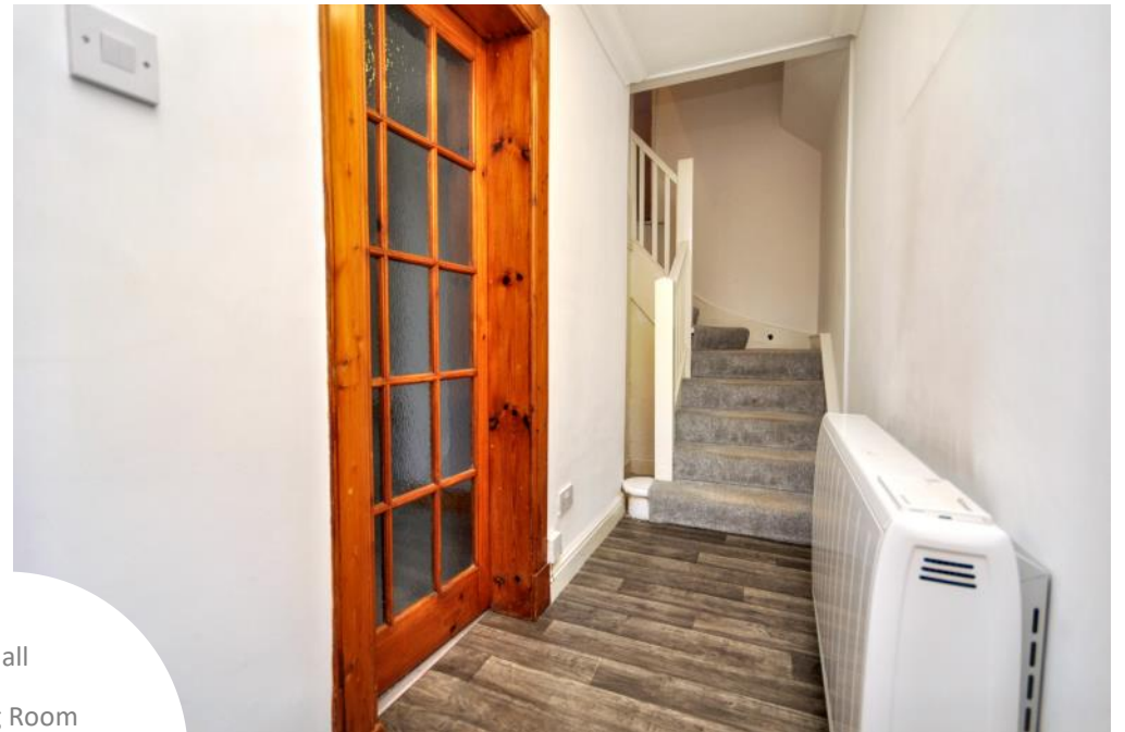
Hall Living Room & Kitchen