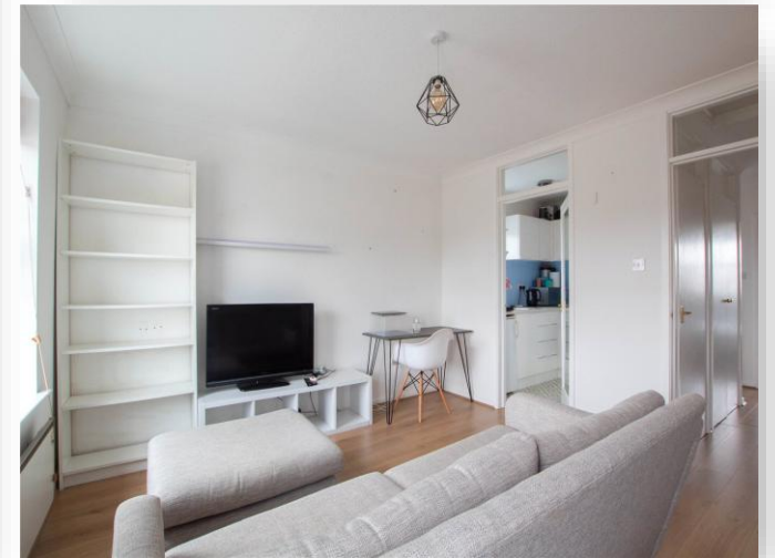
Shepherds Court, Willingham, CB24 5UH