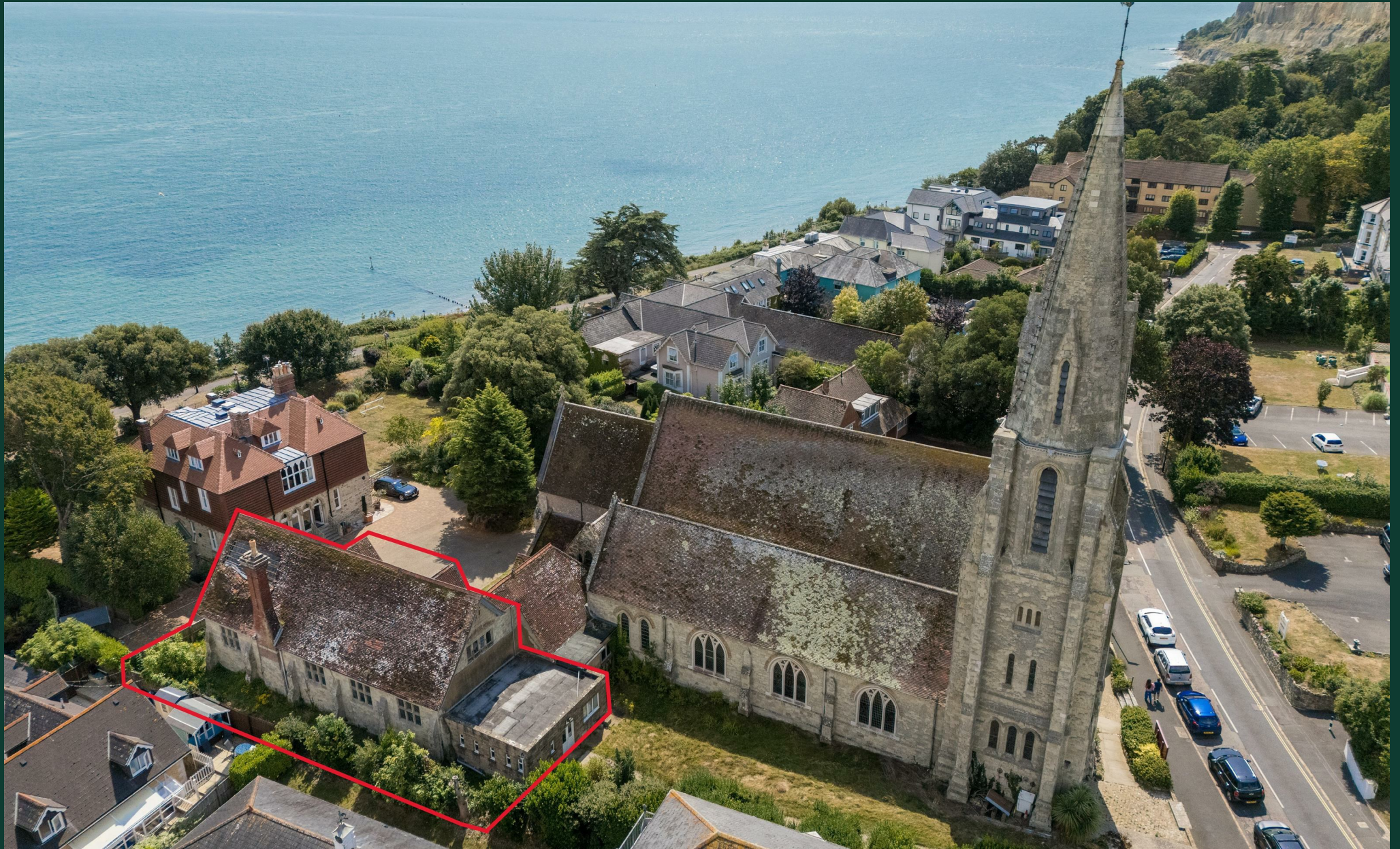
Church Hall, St Saviours, Queens Road, Shanklin, Isle of Wight, PO37 6AN