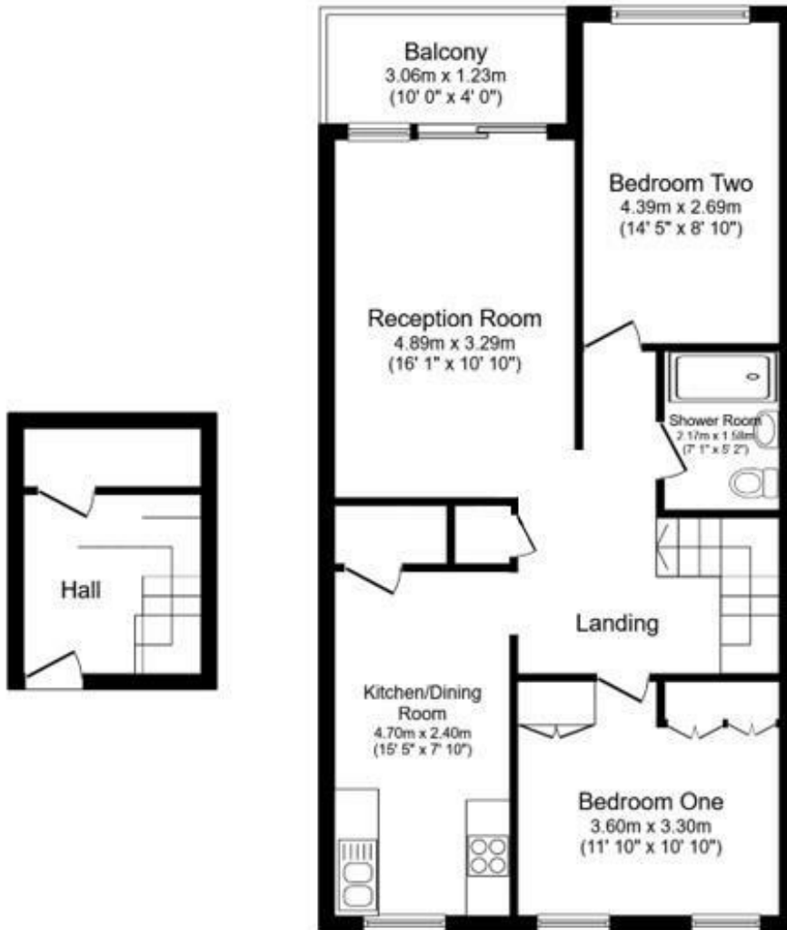
Third Floor Floor area 8.1 sq.m. (88 sq.ft.)