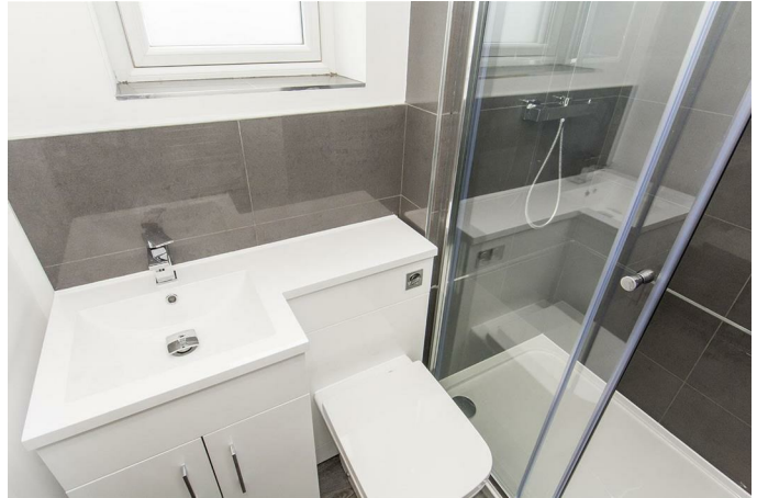
Opaque UPVC double-glazed window to front. WC and wash hand basin inset to storage units. Double width shower cubicle with rain and flexible shower head. Inset LED strips to ceiling. Heated towel rail. Extractor fan. Luxury vinyl tiled flooring.