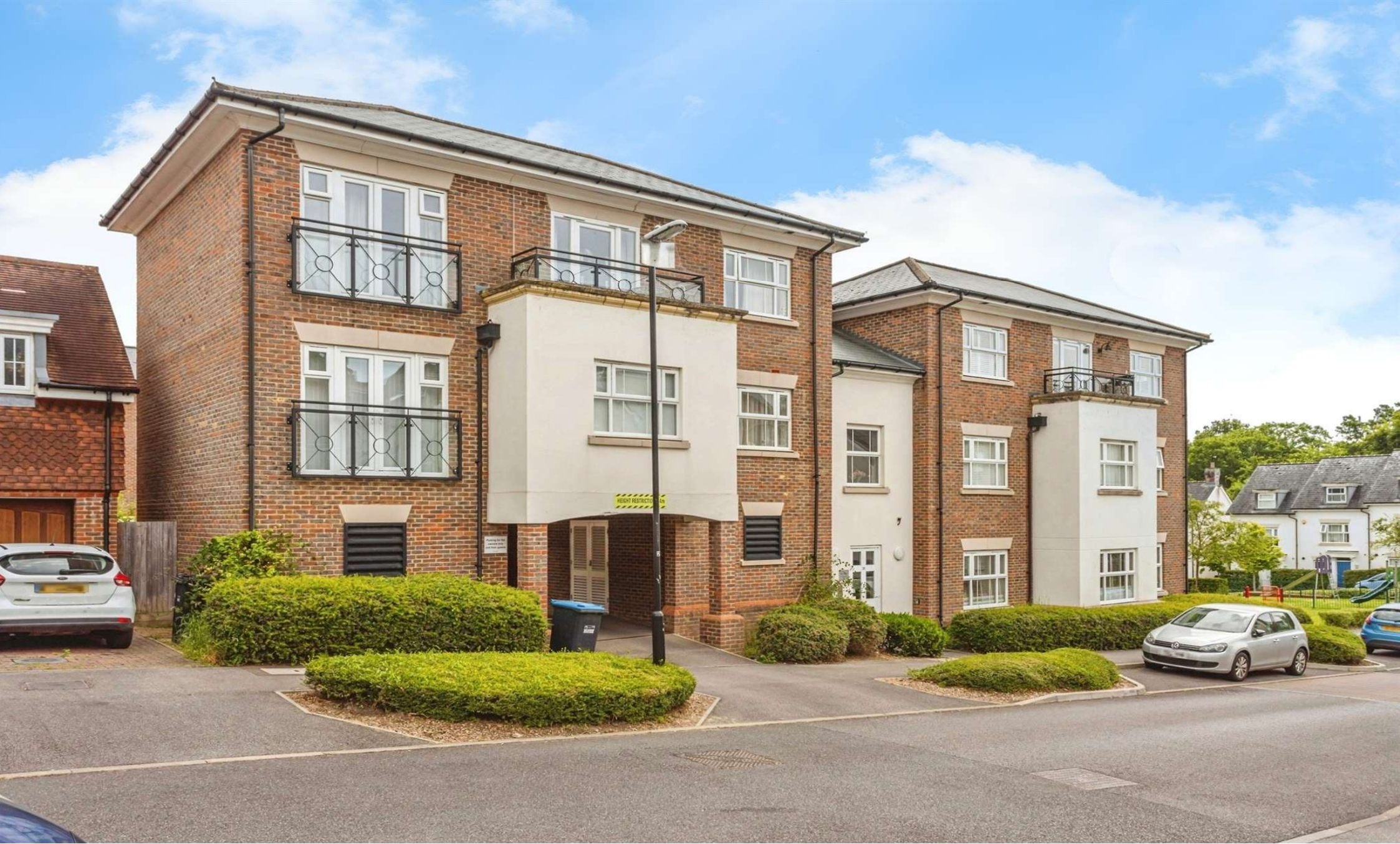
Waverley House, Trubwick Avenue, Haywards Heath RH16 4UR