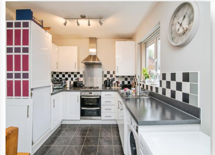
Tomblin Drive, SMETHWICK B66 4TE