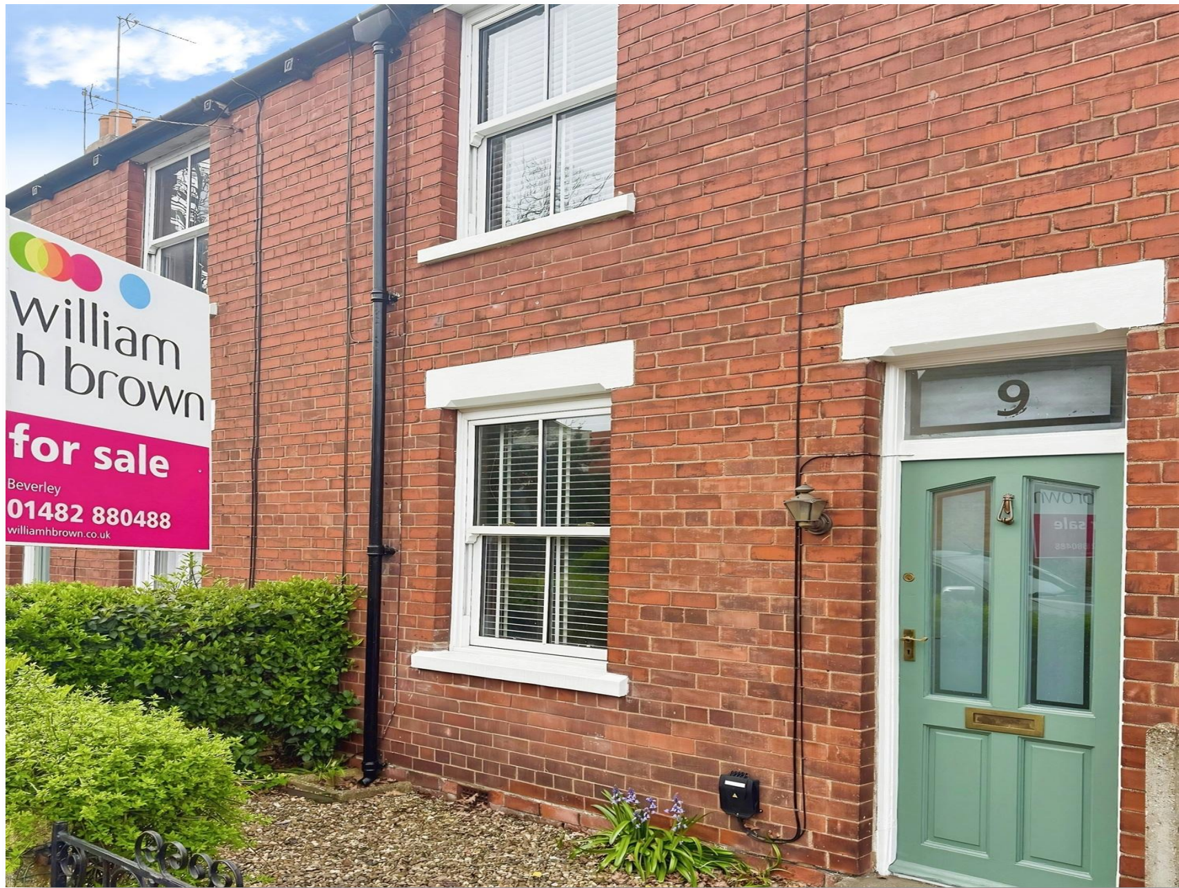
Grayburn Lane, Beverley, HU17 8JR