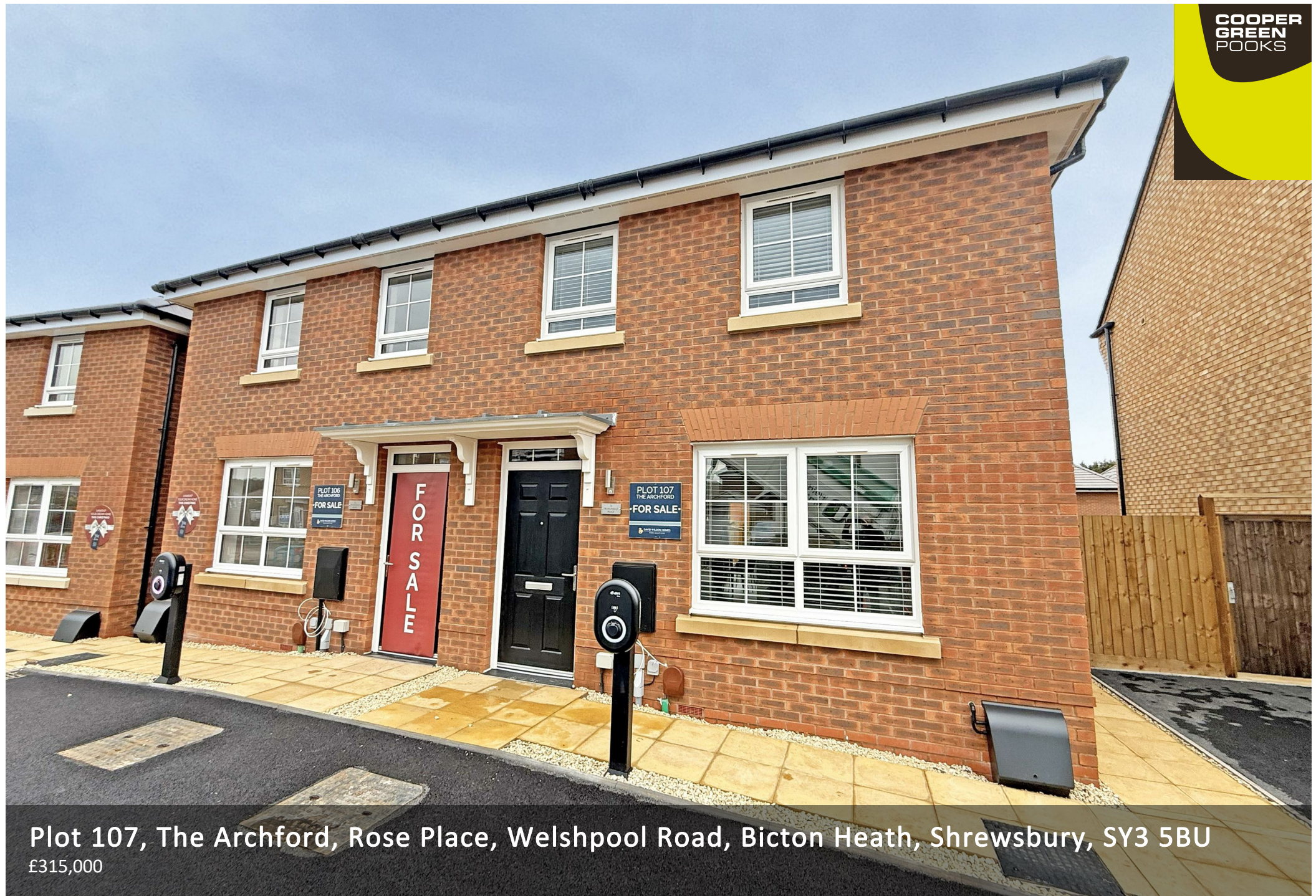
Plot 107, The Archford, Rose Place, Welshpool Road, Bicton Heath, Shrewsbury, SY3 5BU £315,000