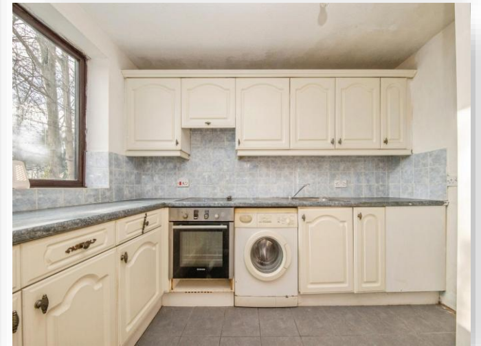
Oakstead Close, Ipswich, IP4 4HW