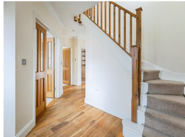
Blenheim Road, Ramsey Huntingdon PE26 1AN