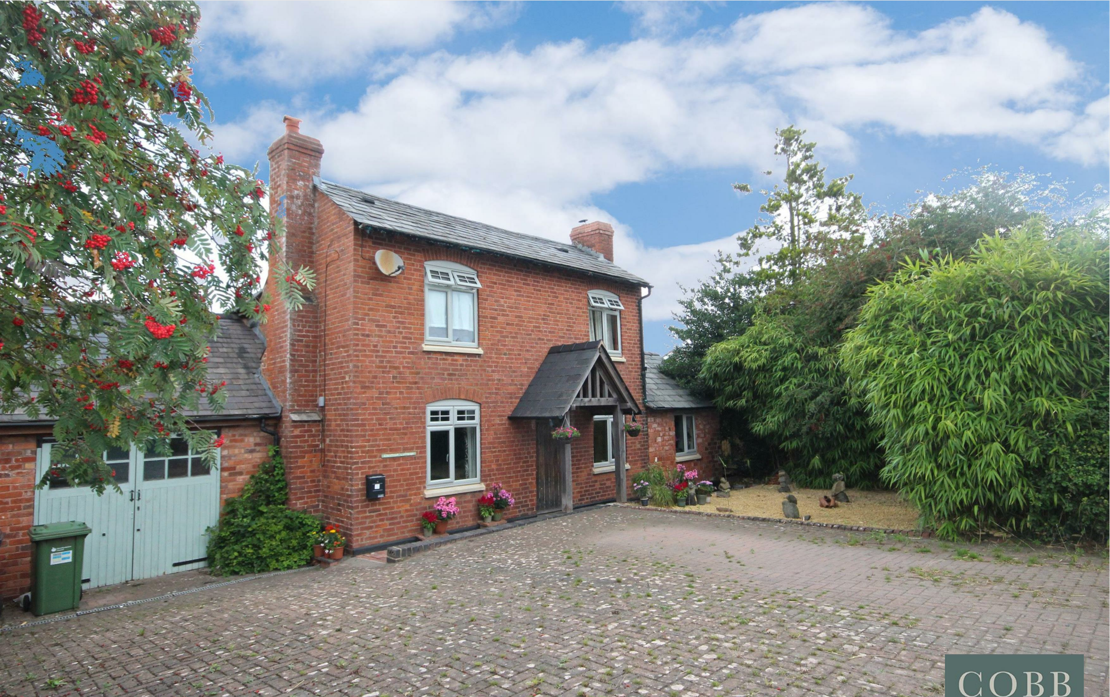
Chestnut Cottage, Burley Gate, Hereford, HR1 3QR Price £410,000